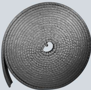
Product # FRMCDRAIN6

Efficient Water Management Solution for Crawl Spaces and Basements