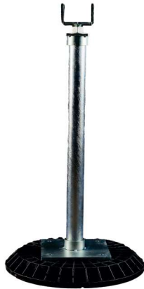
Complete Assembly Shown