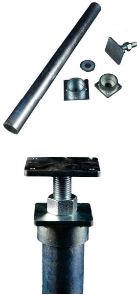
Product # RescueJack