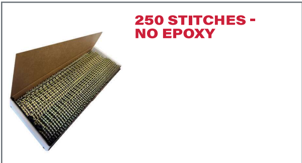
250 STITCHES - NO EPOXY