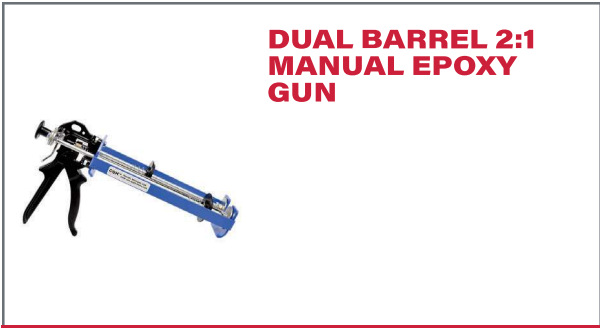
DUAL BARREL 2:1 MANUAL EPOXY GUN