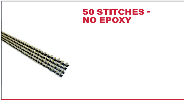
50 STITCHES - NO EPOXY